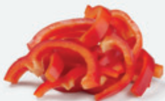
Red pepper strips