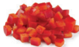
Red pepper dices