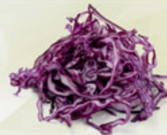
Red cabbage shreds