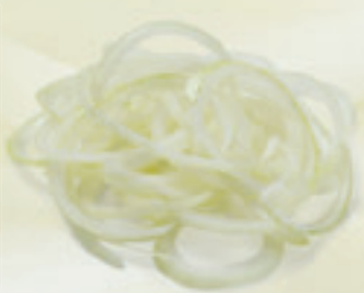
White onion rings

"We are very glad that we made the decision to switch to the Centris 400. The cutting heads are lighter, which makes them easier to handle. And the consistency is impressive: we never have to adjust our cutting head and achieve the same cut every time."