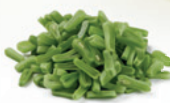
Flat bean slices