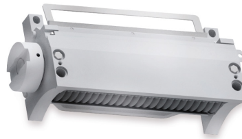
Heavy duty, high-capacity dicer incorporating the SureCut Unit [3]